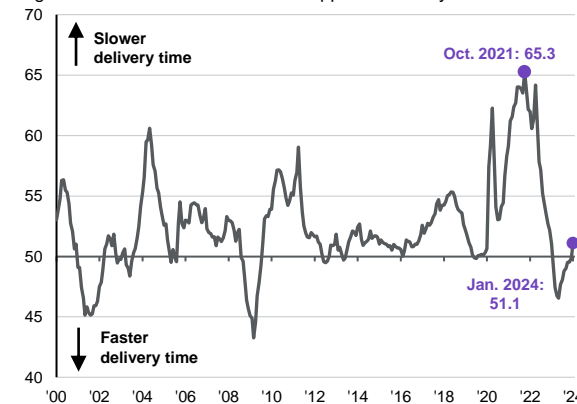
Figure shown is 100 - Global PMI suppliers' delivery times index