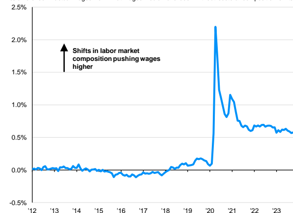
Impact of changing labor market composition on average hourly earnings % difference in actual wages from what wages would have been without sectoral composition shifts